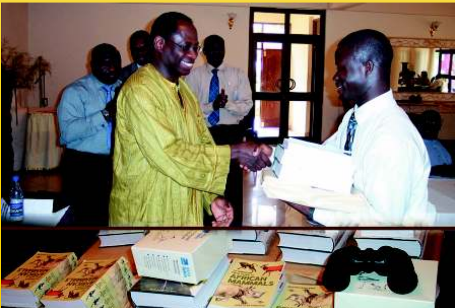
Distribution of books and equipment to trainers by the Minister for New Partnership for African Development (NEPAD) and Regional Cooperation in Ghana.

• Equipment and books estimated at 15,000 Pounds Sterling were distributed to the trained nationals and institutions in the five countries. These included; 75 pairs of binoculars, five telescopes, 75 copies of the sub-regional field guide for Birds of Western Africa, 90 copies of a manual of techniques for field biologists, 35 copies of the Kingdom Field Guide to African Mammals and 30 copies of Field Guide to the Forest Trees of Ghana.