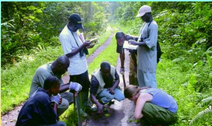
Regional training of trainers. Mammal group identifying footprints.

• One hundred and ninety one (191) nationals from five countries in West Africa (Côte d'Ivoire - 31, Ghana - 34, Guinea - 58, Liberia - 30 and Sierra Leone - 38) were trained in tropical biodiversity identification and survey techniques.